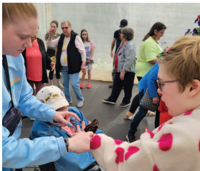
Recreational Therapy clients visit the Fort Wayne Botanical Gardens.